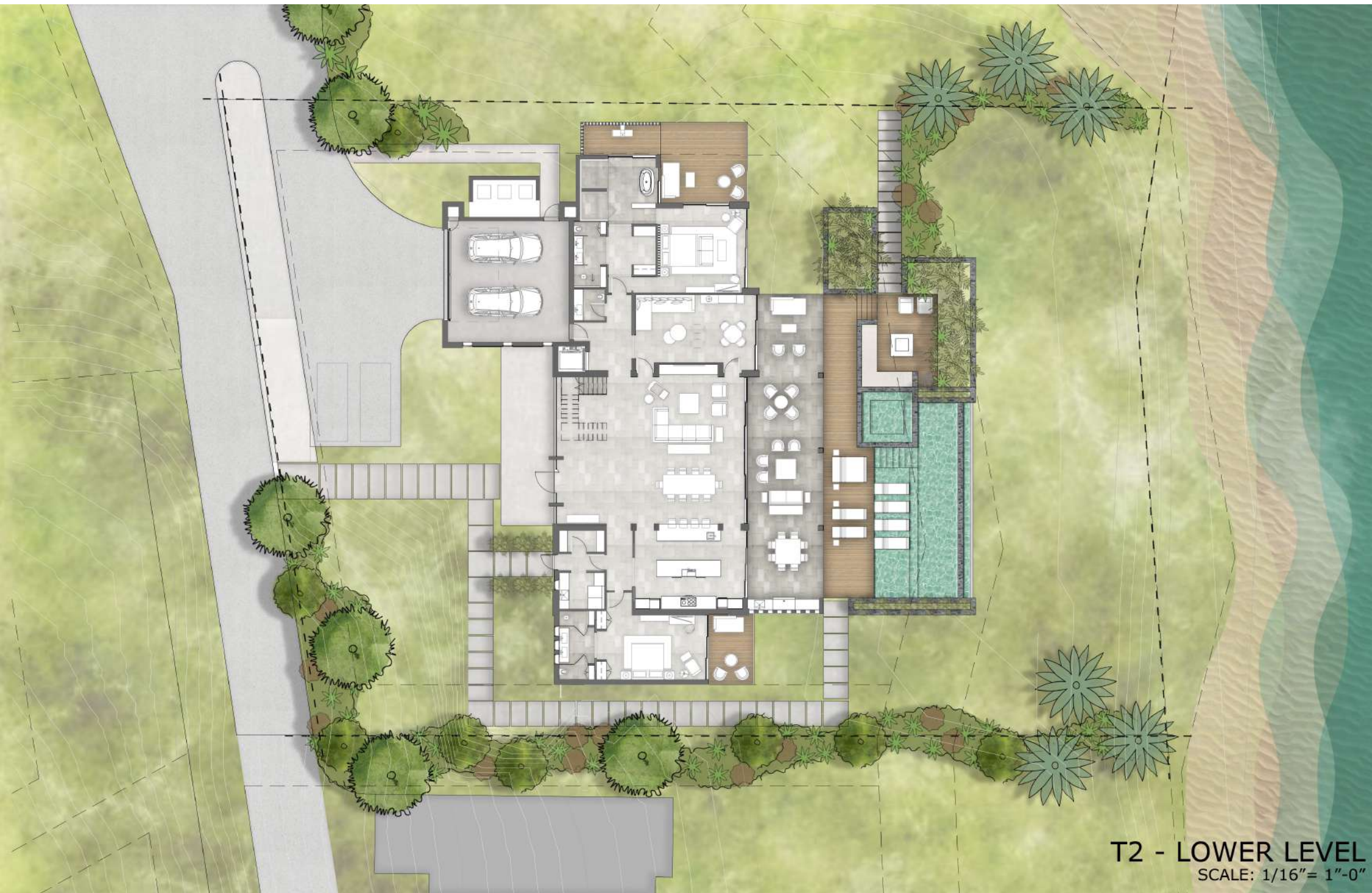
T2 - LOWER LEVEL SCALE: 1/16" = 1"-0"