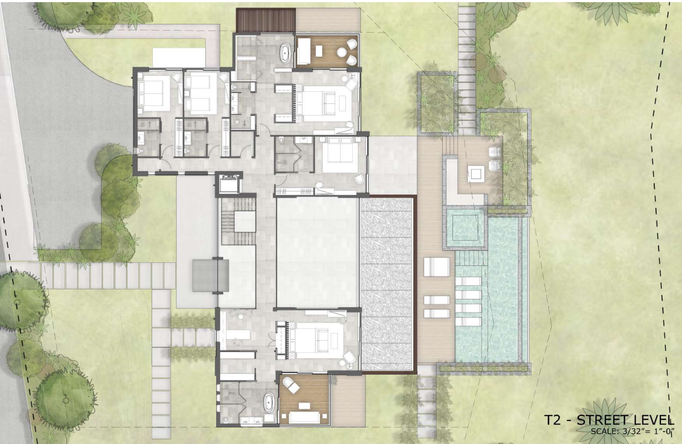
T2 - STREET LEVEL SCALE: 3/32" = 1"-0"